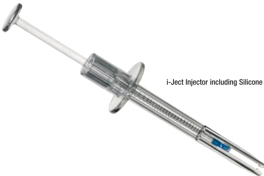
i-Ject Injector including Silicone Stamp.